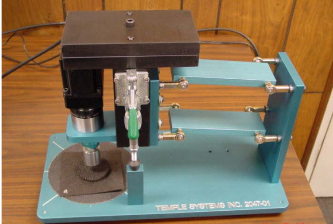
Figure 1. Automated Cohesion Test (under development).

MeadWestvaco has graciously agreed to perform some additional testing on the device before we place it in full production testing.