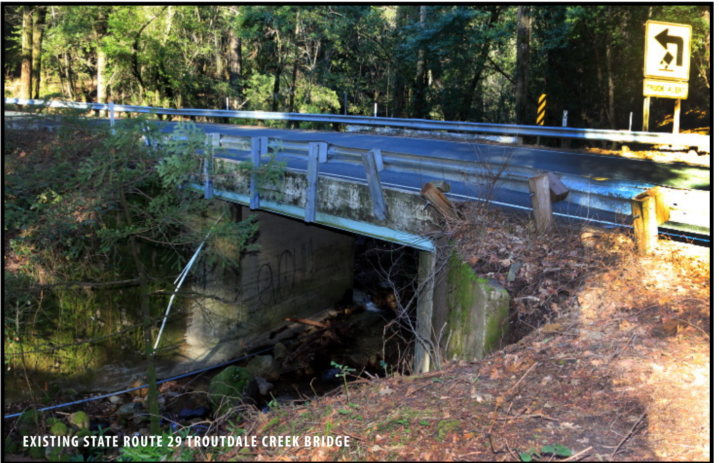
EXISTING STATE ROUTE 29 TROUTDALE CREEK BRIDGE