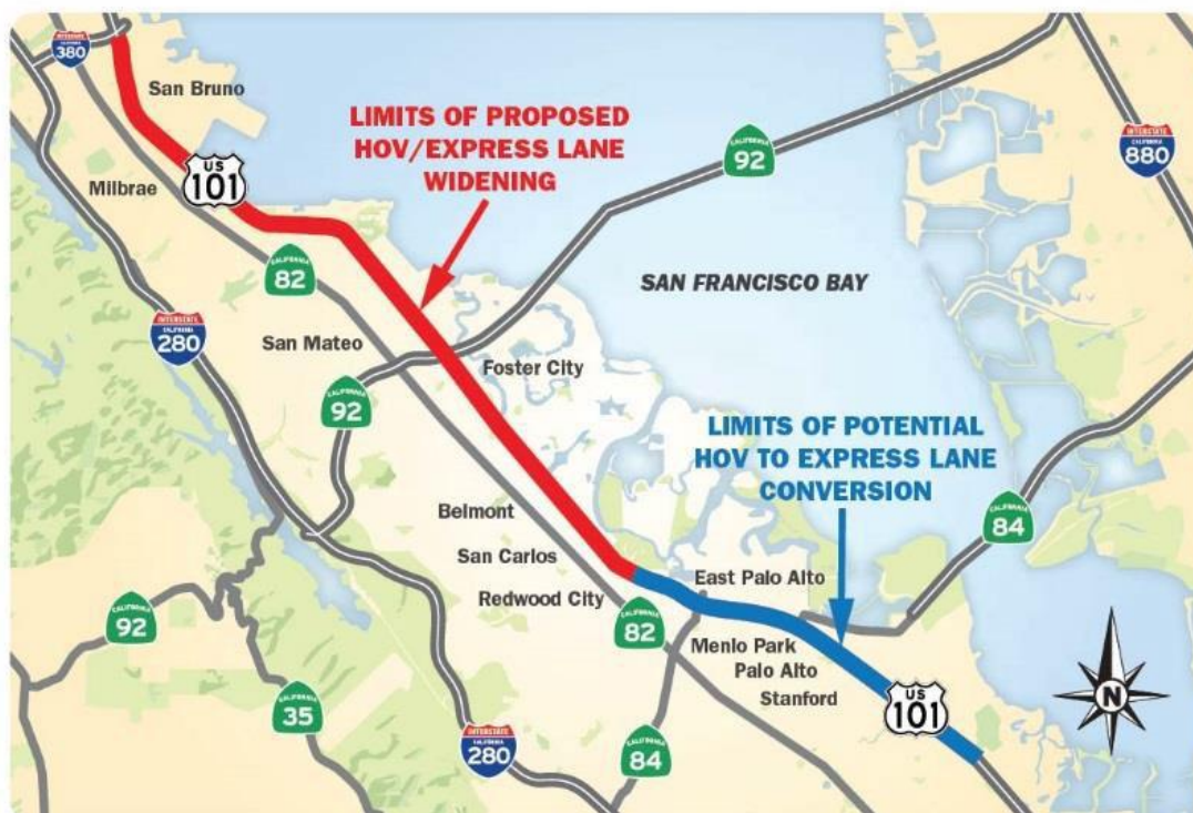
U.S. 101 Managed Lane Project: Red lines show new express lanes; blue lines show existing carpool lanes that will be converted into express lanes.

Depending on the availability of funding, construction of the estimated $519 million project is anticipated to start Spring of 2019.