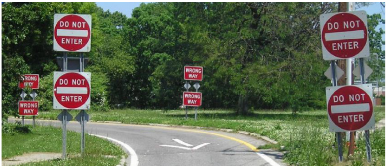
Figure 1: Double-posted “Do Not Enter” and “Wrong-way” signs on an exit ramp.