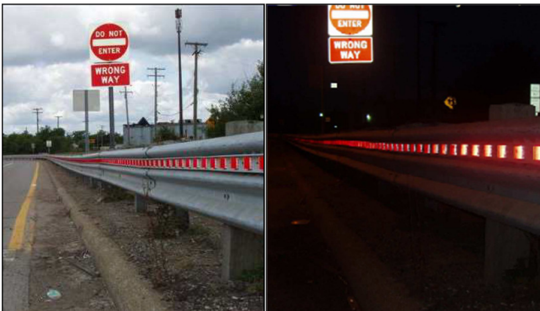
Figure 3: “Do Not Enter” and “Wrong-way” Sign in conjunction with barrier delineator that is visible when going the wrong-way.