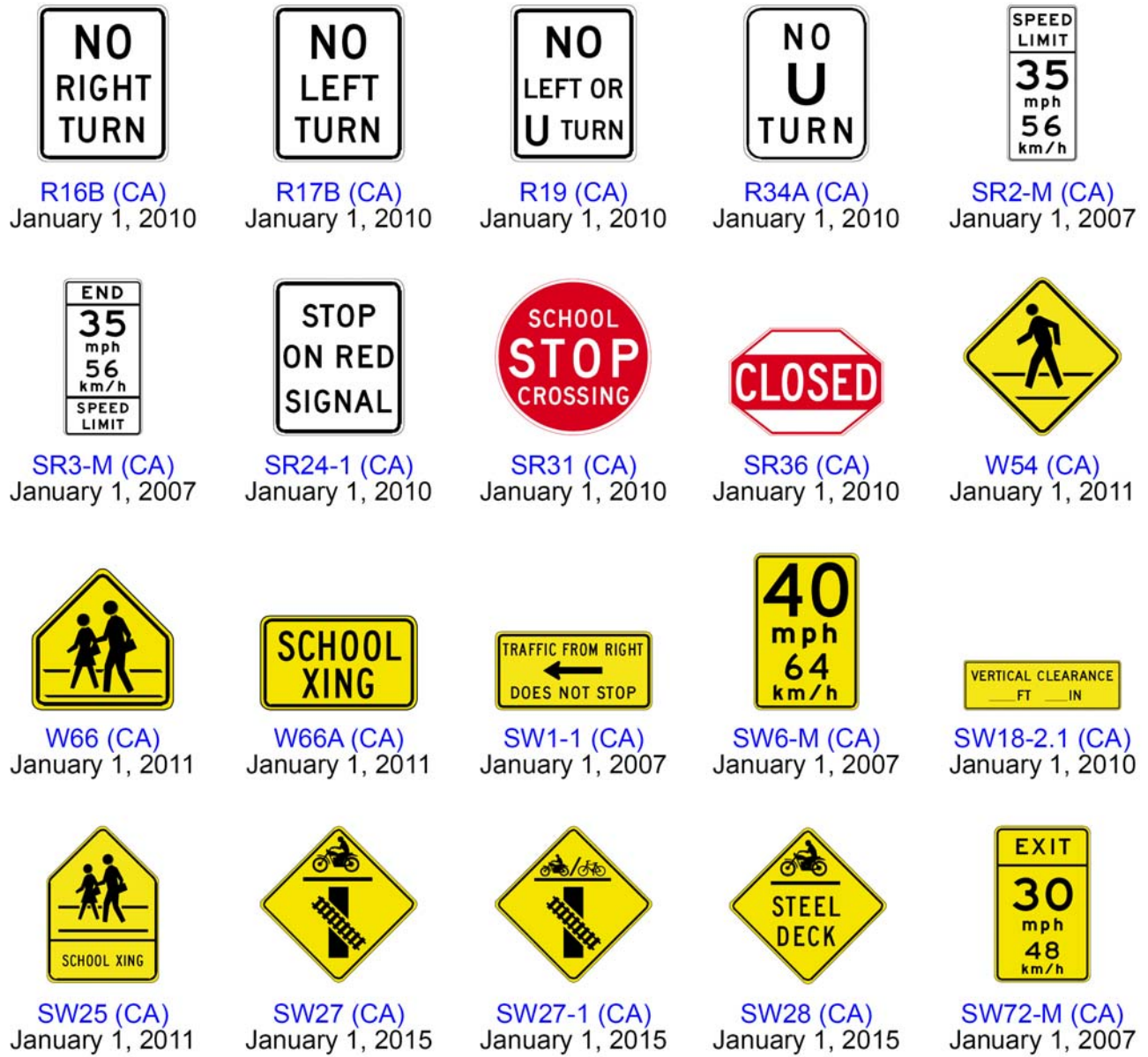
Figure I-101 (CA). Deleted California Signs with Target Compliance Dates