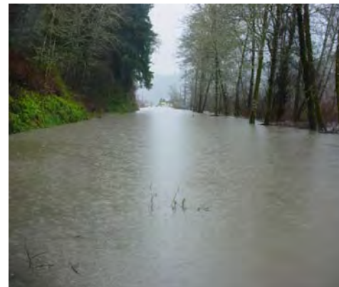
Facility located next to the runoff water course, Klamath flood, Highway 101, 2006.