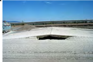
Derailment from warped tracks due to extreme heat. Upward slab movement and shattering at a joint or crack.