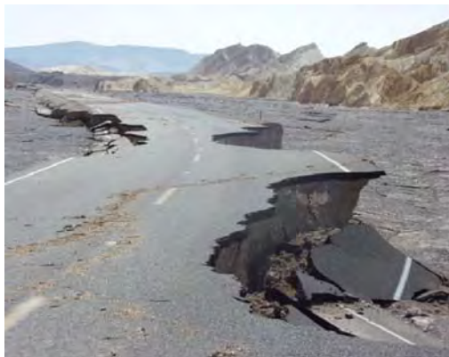
Water sheet flow crossing, Highway 190 in Death Valley 2004.