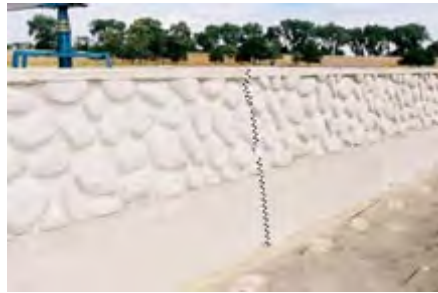
Large Cobble Horizontal Reveal

that the guidelines will have widespread application.