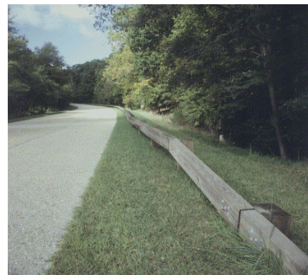
Steel-Backed Timber Guardrail

These non-proprietary rails are aesthetic alternatives to metal beam guardrail in scenic areas where a more rustic appearance is desired. Both of these devices feature heavy timber rails with a steel strap screwed to the back side to provide additional tensile strength. The Merritt Parkway Guiderail uses steel posts while the steel-backed timber guardrail uses timber posts. On the downside, there are no crashworthy end treatments or approved transition sections for either of these rails and they are quite expensive to install.