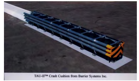
TAU-II™ Crash Cushion

This crash cushion, manufactured by Barrier Systems, Inc., is similar in concept to Energy Absorption Systems’ QuadGuard. The TAU-II™ features a number of energy absorbing plastic modules supported between steel diaphragms with slotted thrie beam panels on the sides. When struck on the upstream end, the entire system telescopes and slides back, crushing the plastic modules. The system is available in both in test level 2 (TL-2) and test level 3 (TL-3) configurations. TL-2 systems are designed for low-speed (70 km/h) applications, while TL-3 systems are rated for high-speed (100 km/h) conditions.