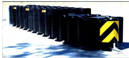
REACT 350™ (60")

The Department approved the standard REACT 350™ several years ago and the device has proven to be a durable, low-maintenance crash cushion. The standard REACT consists of a single row of nine, high-density polyethylene cylinders with an outer diameter of 914 mm (36 in). The REACT 350™ (60") is a wider version of the original REACT, and is designed to protect obstacles up to 1524-mm (60 in) in width. This model comprises two parallel rows of 13 polyethylene cylinders with diameters of 610 mm (24 in) plus a single cylinder on the nose, for a total of 27 cylinders.