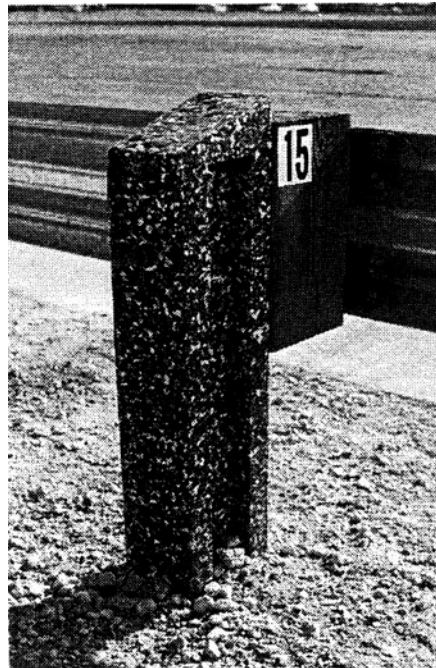
Amity Plastic Guardrail Post

Amity Plastics, Ltd., a Canadian firm, has developed a guardrail post made of steel-reinforced, recycled plastic that performs much like conventional steel and wood posts in crash tests. The Amity post was tested with conventional wood blockouts, although approved recycled plastic blockouts should also be a satisfactory alternative. Amity Plastics has indicated that they plan to fabricate posts in the U.S. to make their product more cost-competitive