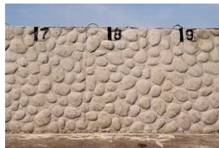
Shallow Relief Cobble

The test vehicles snagged on the large cobble and shallow relief cobble, resulting in substantial occupant compartment deformation. The diagonal rib pattern (ribs angled 45 degrees to the roadway) caused the impacting vehicle to climb up the face of the barrier and roll over. These three textures were judged to be unacceptable. The rib pattern was also considered unacceptable regardless of angle because it was damaged so extensively by the impact of a subcompact sedan.