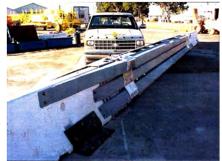
SafeGuard™ Gate System

This gate is available in lengths of 8, 12 and 16 meters. It is currently designed only to connect to Type 50 median barrier, but Barrier Systems indicates that they can make adaptor sections for Type 60 barrier.