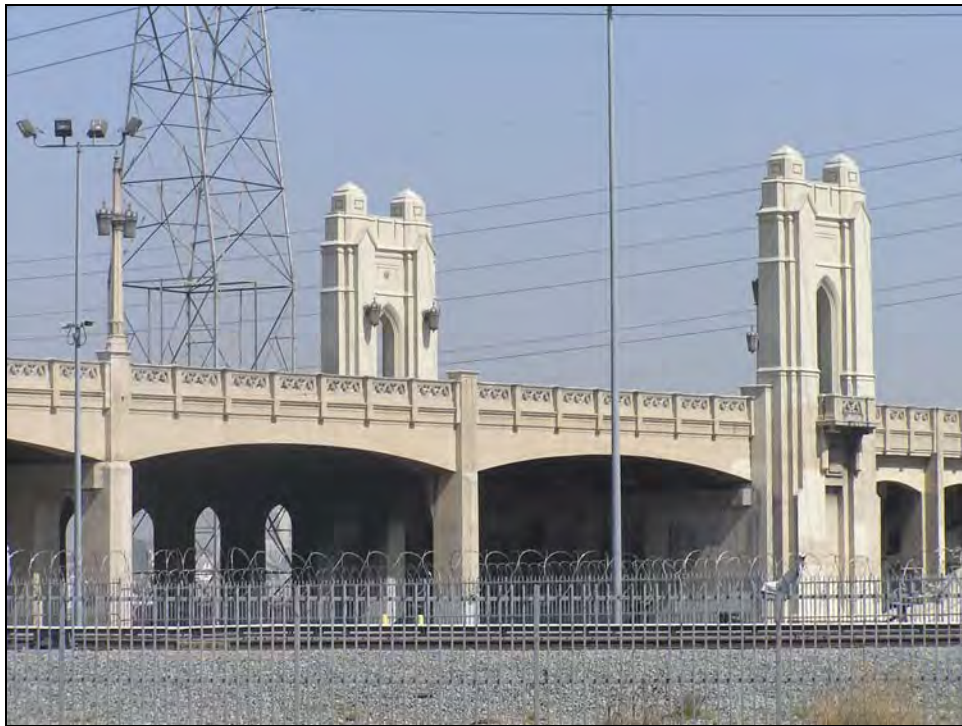
Photograph 2: Fourth Street over Los Angeles River (53C0044): Gothic Revival Details