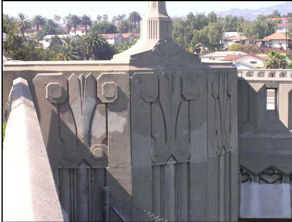
Photograph 3: Gaffey Street at Highway 110 Bridge (53 0397Y): Art Deco Details