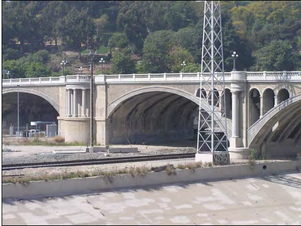
Photograph 1: “Buena Vista Bridge,” North Broadway over Los Angeles River (53C0545): Beaux Art Classical Details