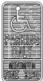
SGN R99C (CA) See Note 3