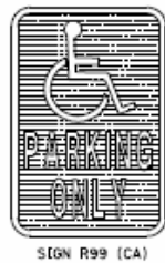
SGN R99 (CA)