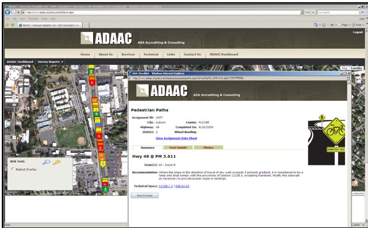
Multiple ADA Transition Plan Locations Displayed in a Google Earth Format

In 2009 Caltrans contracted the services of ADA Accrediting & Consulting to assess Caltrans' pedestrian infrastructure along the State Highway System and to develop an updated ADA compliance transition plan. The assessment of 4,000 miles of sidewalks and street crossings was completed in June 2011. More than 30,000 noncompliant locations were identified and included in Caltrans' ADA transition plan in a database form for public viewing and for use as a project development tool. The transition plan can be accessed at < http://www.adaac.org/secured/asset/caltran/TransitionReport.aspx?mode=public >.