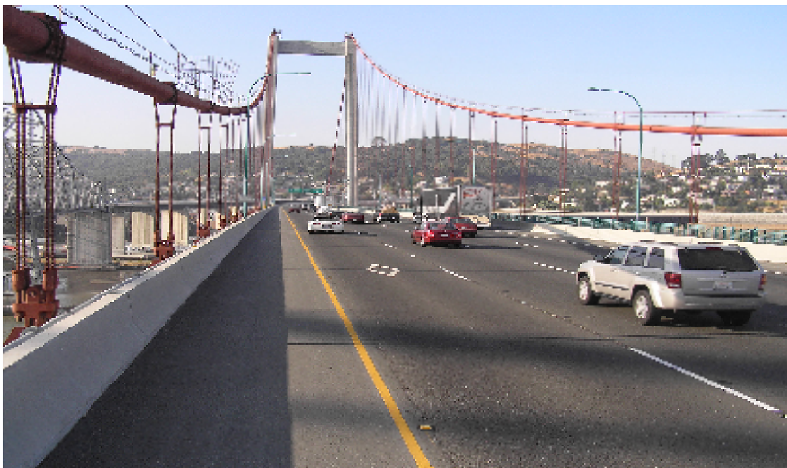
Volumes, occupancies and violation rates for freeway High Occupancy Vehicle Lanes in the San Francisco Bay Area