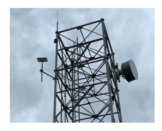
Image 1: Starlink high-performance antenna (left side of image) after installation at the Redding Fiber Hub