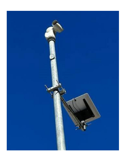
Image 3: Starlink high-performance flat antenna after installation