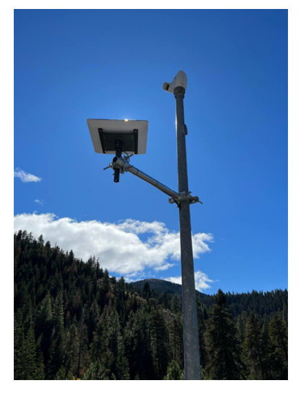
Image 2: Starlink high-performance flat antenna after installation

The contents of this document reflect the views of the authors, who are responsible for the facts and accuracy of the data presented herein. The contents do not necessarily reflect the official views or policies of the California Department of Transportation, the State of California, or the Federal Highway Administration. This document does not constitute a standard, specification, or regulation. No part of this publication should be construed as an endorsement for a commercial product, manufacturer, contractor, or consultant. Any trade names or photos of commercial products appearing in this document are for clarity only.