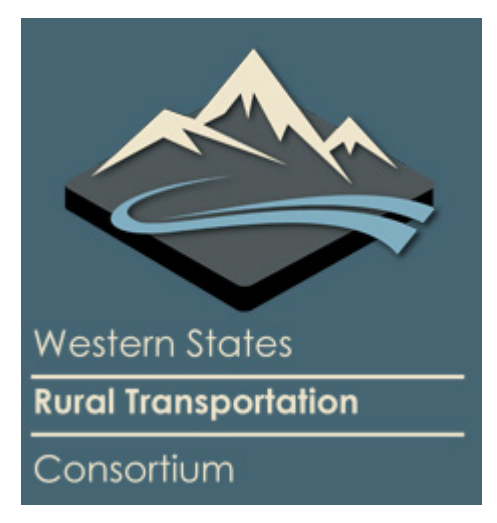
Image 1: Logo for the Western States Rural Transportation Consortium