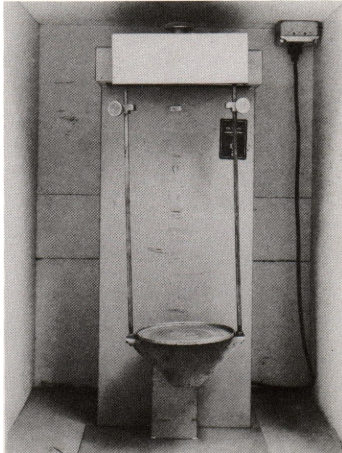
Figure 1 Standard Mechanical Agitator