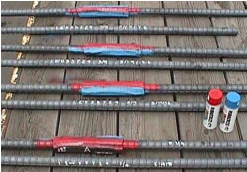
Figure 1. Production Sample Splices with rubberized paint used as a tamper proof marking system. Associated control bars are no longer required by the Contract Specifications .

All samples must be identified pre-job, production, or job QA and be accompanied with Form TL-0101 , Sample Identification Card . See Figure No. 2. Both pre-job and quality assurance ultimate butt splice test samples need to be shipped to METS at 5900 Folsom Boulevard, Sacramento 95819, (916) 227-7251. The Structure Representative should discuss the method of shipment with METS.