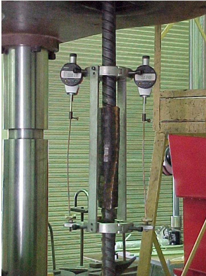
Figure 1. Example of dial indicators used for measuring slip.