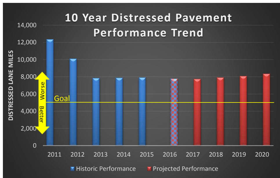
Chart 1 - Pavement Performance Trend and Forecast Performance

The projections of future performance assumes that the funding level available to rehabilitate pavement remains at current funding levels, deterioration rates follow historical patterns and construction buying power remains flat over the five year period. It also assumes the adoption of the 2016 SHOPP projects as proposed and a stable funding picture for pavement maintenance through the Caltrans’ Maintenance Program.