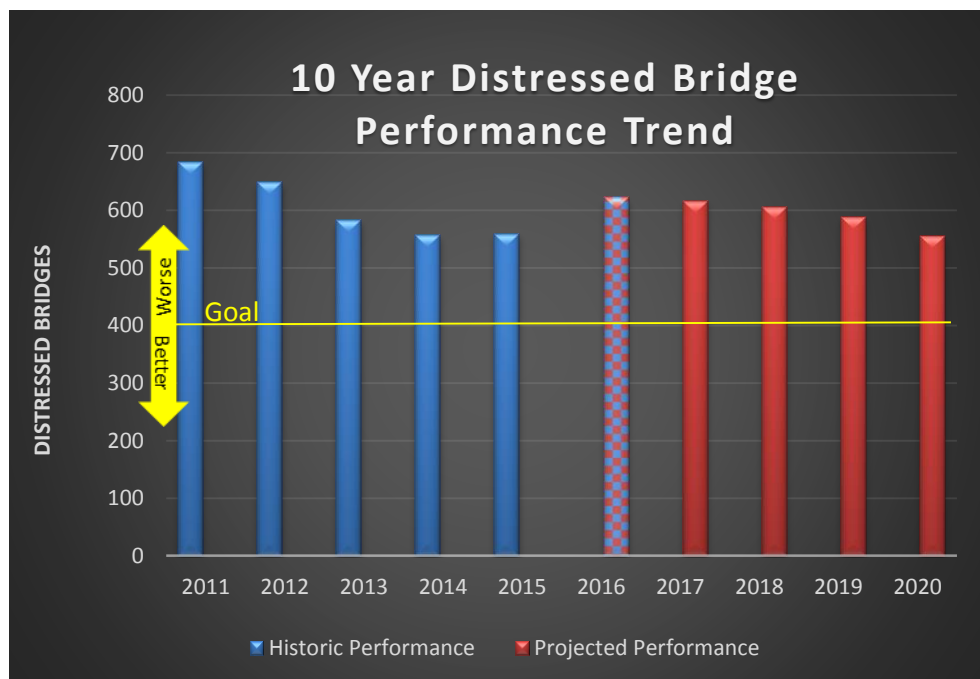
Chart 2 – Bridge Performance Trend and Forecast Performance

The projections of future performance assume that the funding level available to rehabilitate bridges remains at current funding levels, deterioration rates follow historical patterns and construction buying power remains flat over the five year period. Chart 2 also assumes the adoption of the 2016 SHOPP projects as proposed and a stable funding picture for the Bridge Maintenance Program.